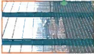
4.07m High Duex 868 Rebound Fencing

Duex 868 Rebound has additional 8mm diameter wires to the bottom 1.2mtr section of the Duex 868 panels, making the Rebound system extremely rigid and ideal for multi-use games area. These extra wires give smaller apertures of 50 x 60mm, allowing a much more robust rigid surface which provides a more aesthetically pleasing, practical and longer lasting solution.