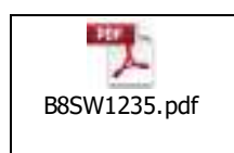
Figure A.3 – Response from Cwm Taf University Health Board

NB: Double-click on the icon to view the response.